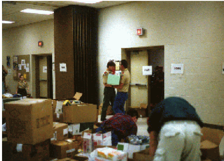
Though it was physically exhausting work, it was self rewarding!

Most live all their lives worried about what others think and take no time to be consider about their golden years yet alone their eternal residence. What are you currently doing that will live for centuries after you have gone? How will your actions today benefit millions who follow you? Does Jesus know you? Will your life get you into heaven? How many people will be saved because of your life? How many will follow after you have died?