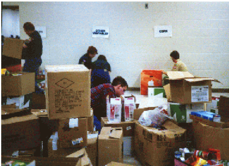
The food came in from schools and civic groups all around central ohio. Boxes upon boxes needing sorted into appropriate food groups.