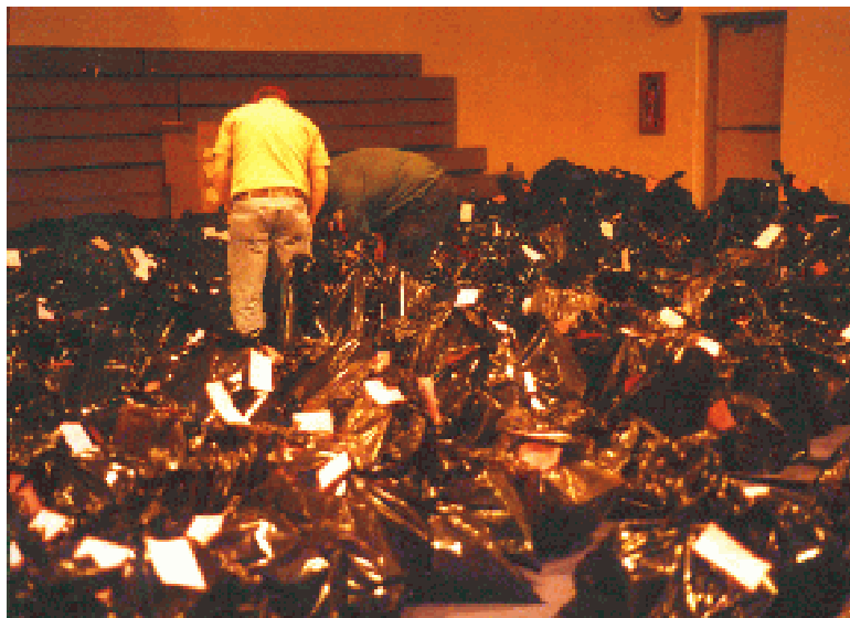
369 sorted enough toys for over 2,000 families!

To get yourself on the reflector (hint, if you got this email, you're on the reflector), mail to: major-domo@math.ohio-state.edu This is only open to members of the crew and is a closed list. Write in the text feild: