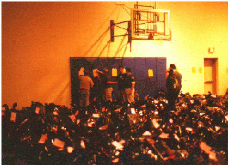
The average family had about 4 children! That means about 8,000 children received new toys for Christmas!

We, as of December 7th 2000, are the 13th best scouting web site on in the world! We have hits. We have a massive page, and it's a lot for a few people to keep updated. If we all help, it will be minimal work. This requirement, worth 5 points, varies with the level of HTML understanding the individual has. A white cord without HTML knowledge will get this five points for finding spelling errors in our preexisting pages and sending corrections to the reflector. A white cord with knowledge of HTML can get credit for writing a personal or crew web page. Red cord or above must improve a page that is not personal! This can be