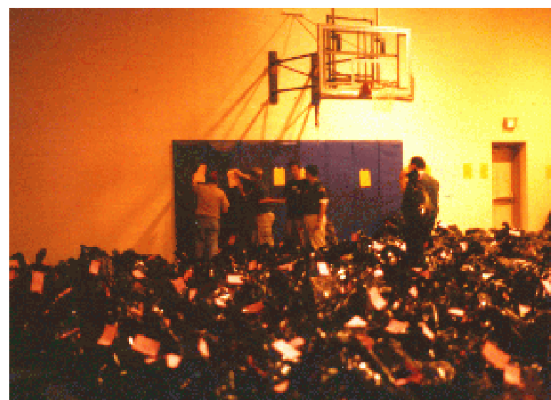
The average family had about 4 children! That means about 8,000 children received new toys for Christmas!

We, as of December 7th 2000, are the 13th best scouting web site on in the world! We have hits. We have a massive page, and it's a lot for a few people to keep updated. If we all help, it will be minimal work. This requirement, worth 5 points, varies with the level of HTML understanding the individual has. A white cord without HTML knowledge will get this five points for finding spelling errors in our preexisting pages and sending corrections to the reflector. A white cord with knowledge of HTML can get credit for writing a personal or crew web page. Red cord or above must improve a page that is not personal! This can be