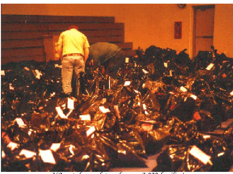
369 sorted enough toys for over 2,000 families!

To get yourself on the reflector (hint, if you got this email, you're on the reflector), mail to: majordomo@math.ohio-state.edu This is only open to members of the crew and is a closed list. Write in the text feild: