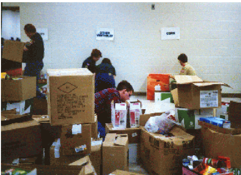
The food came in from schools and civic groups all around central ohio. Boxes upon boxes needing sorted into appropriate food groups.